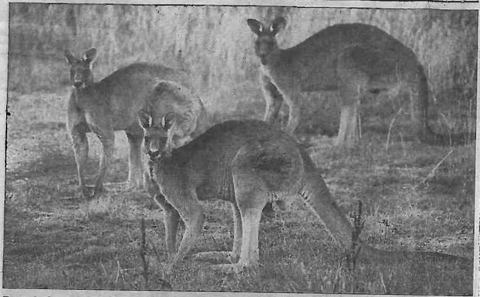
Population explosion ... Kangaroos are reaching unsustainable levels across NSW, according to a farmer advocate group.

KANGAROOS EVOLVED TO TIP TOE OVER DELICATE LAND - STILL THE BEST NATURAL FARM FOOD ANIMAL - FOR HUMANS.